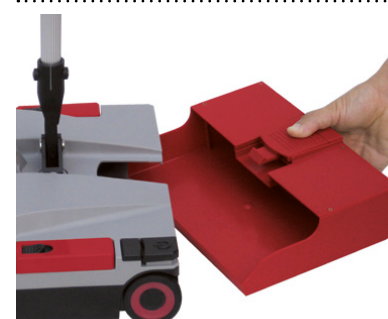
Especially large waste collection tray with a volume of 2 litres.