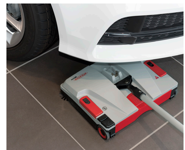
Cordless, efficient, compact and agile.