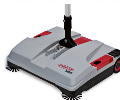
Rotating cornerbrushes for perfect results in corners and edges.