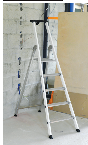
EXPERT 54 - 5 STEPS