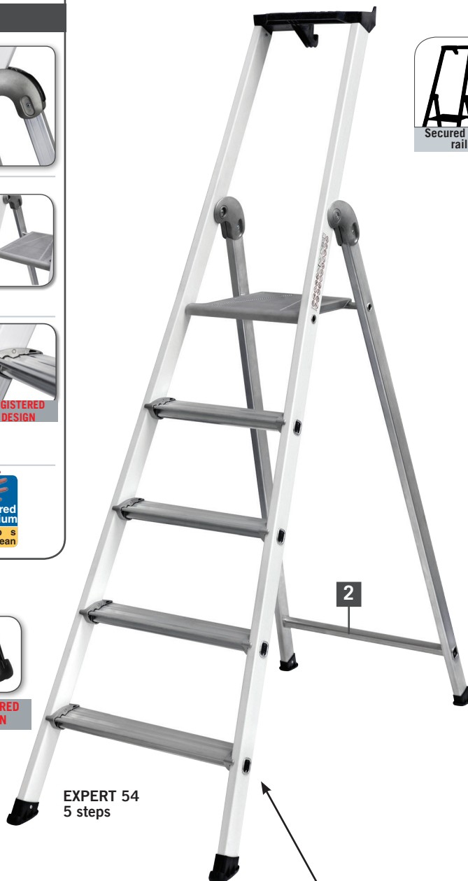
EXPERT 54 5 steps